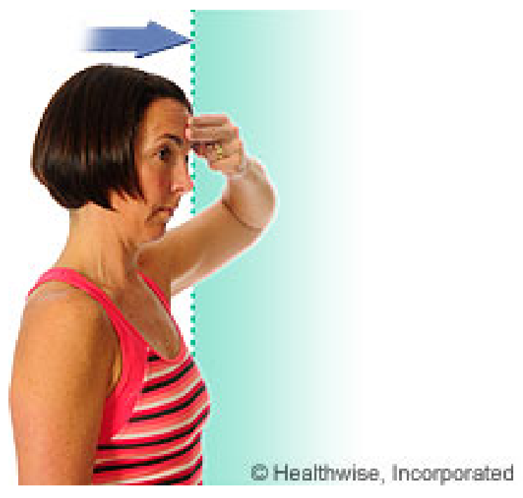
slide 5 of 7