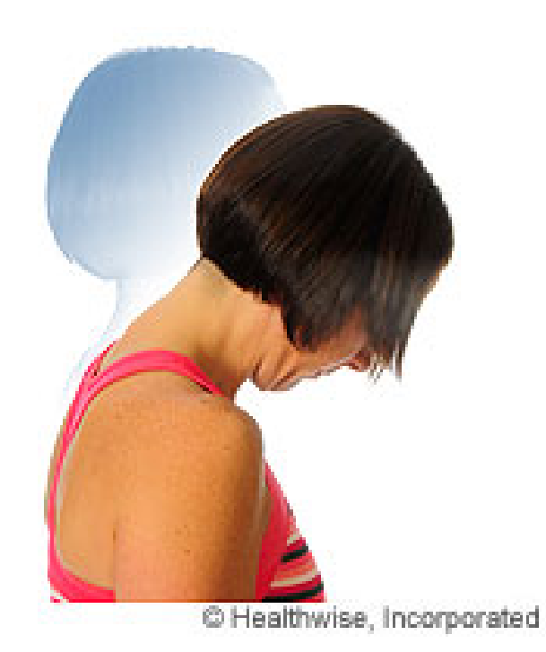
slide 3 of 7