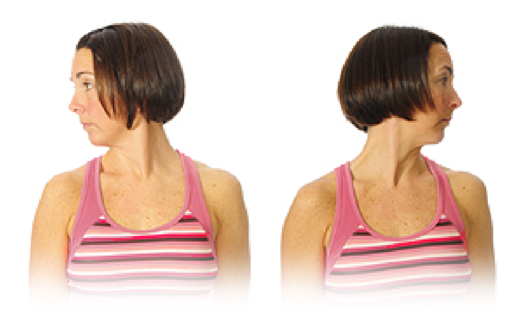
C Healthwise, Incorporated