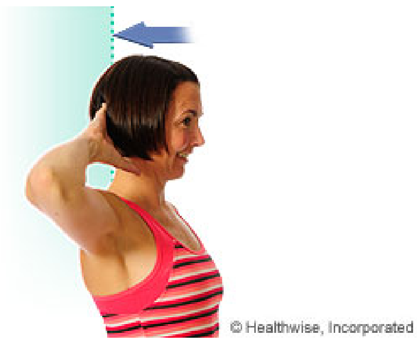
slide 6 of 7