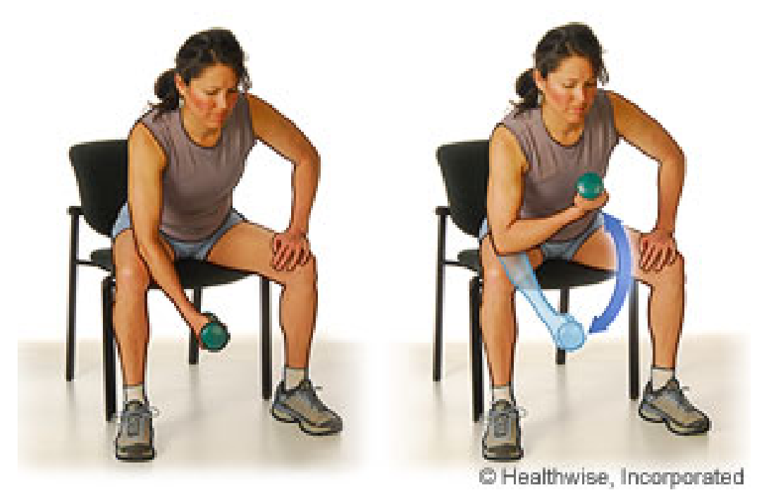
slide 6 of 6