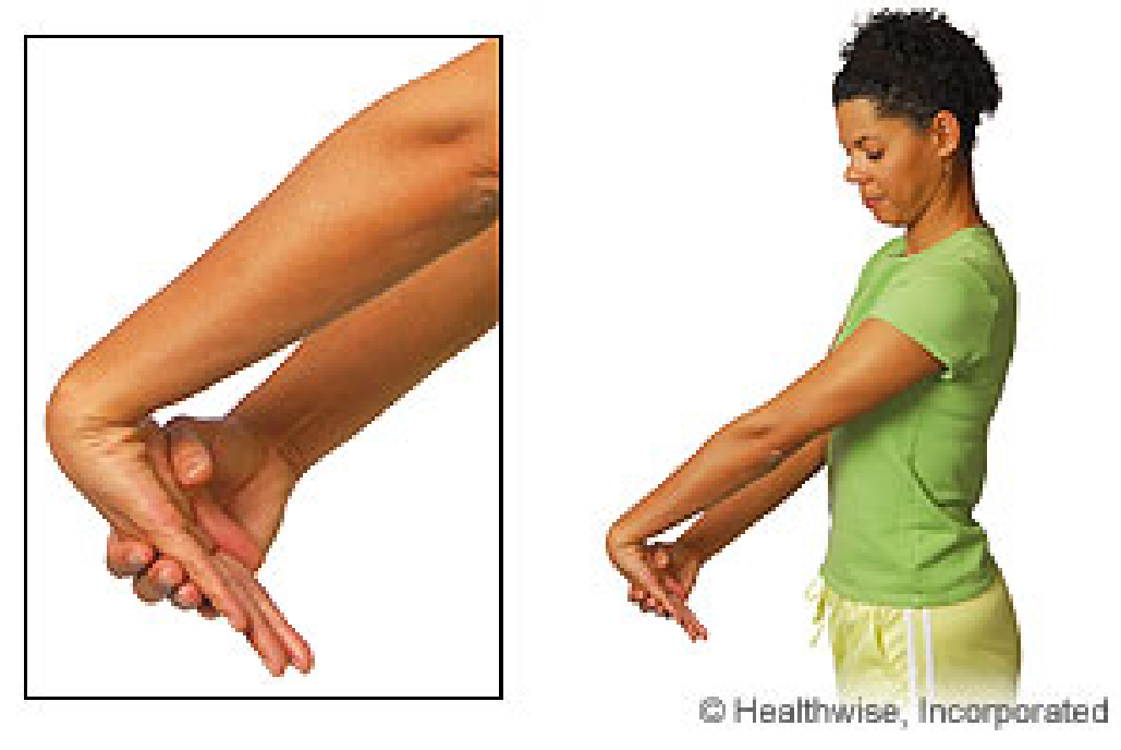
slide 2 of 6

Repeat steps 1 to 4 of the stretch above but begin with your extended hand palm down.