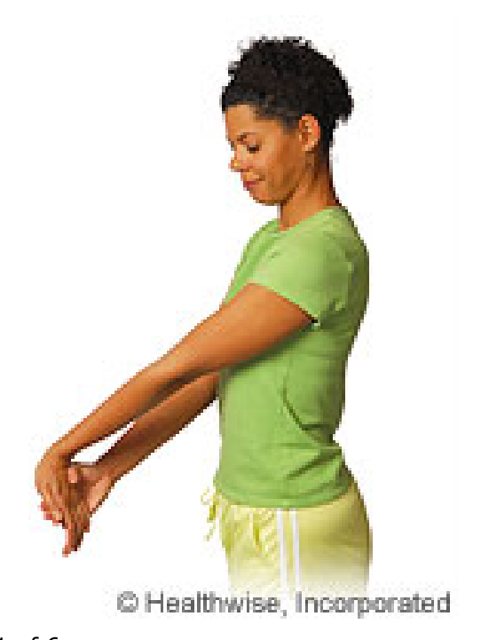
slide 1 of 6